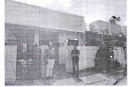
PHOTO OF THE PROPERTY

E-Auction Website: https://canarabank.auctiontiger.net